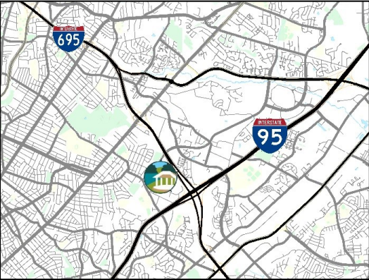
Holt Park is located near Kenwood Avenue.